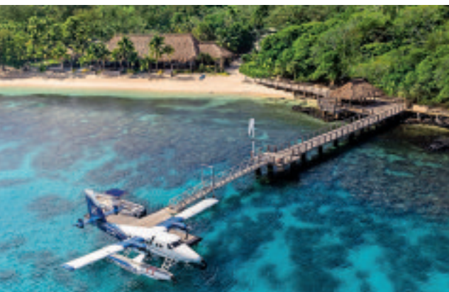
KOKOMO PRIVATE ISLAND, FIJI – ONE BEDROOM PRIVATE BEACHFRONT VILLA FROM £1,750 PER NIGHT

Despite leaving the city hum behind, many a private island can offer superlative amenities such as holistic spa treatments, fully equipped gyms, jet skis, golf buggies or yachts for transport, 24-hour security and even generously stocked wine cellars. Island cuisine is always supremely fresh too, and the opportunity to snorkel or dive in some of the world's top coral reefs is far too good to be missed.