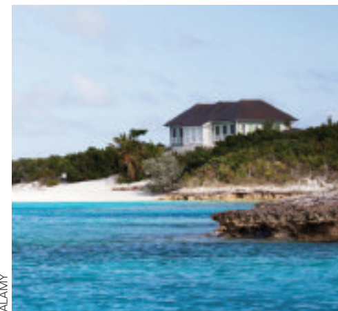
MUSHA CAY, BAHAMAS – EXCLUSIVE USE FROM £34,800 PER NIGHT

There is an unidentifiable attractiveness to holidaying on a private island that goes beyond the five-star luxury element. Perhaps it's the natural surroundings? Could it be the welcome solitude? Maybe it's the complete lack of noise and air pollution? Or possibly it's the sensation of landing directly on your island of choice, knowing this is exactly where you want to be. Well, for a few days at least. ■