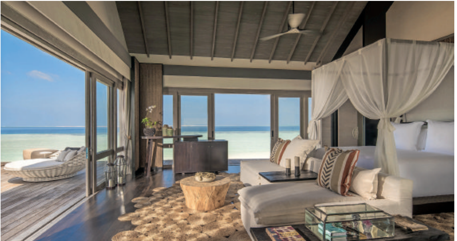
FOUR SEASONS, VOAVAH, MALDIVES – EXCLUSIVE USE FROM £35,000 PER NIGHT