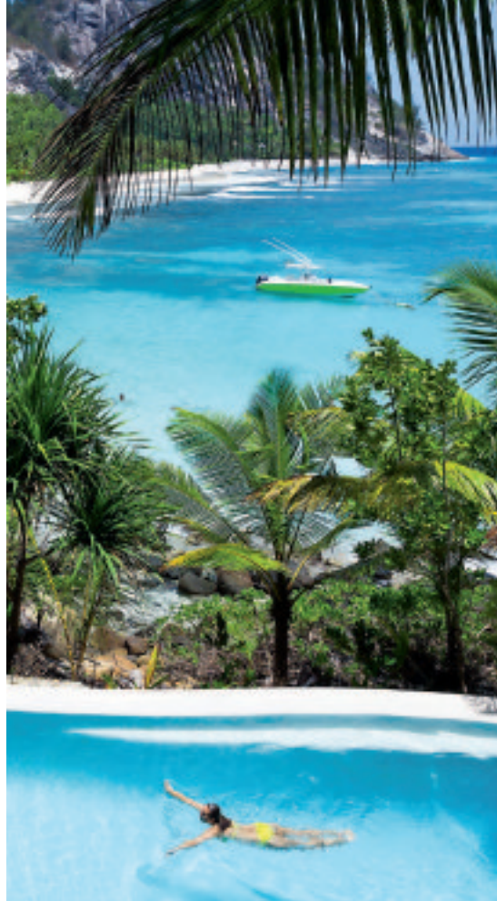
NORTH ISLAND, SEYCHELLES – VILLA FROM £5,390 PER NIGHT

The magic of an island retreat has proven irresistible to several celebrities and many prominent names have purchased their own slice of paradise. Musha Cay in the