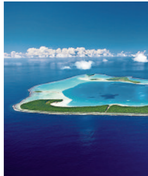
THE BRANDO, FRENCH POLYNESIA – ONE BEDROOM VILLA FROM £2,630 PER NIGHT

in March 2017, welcoming guests to 21 modern beachfront villas. World-class diving in the Great Astrolabe Reef is at your fingertips, alongside seamless hospitality at the authentic Fijian spa, Yaukuve. Organic cuisine is sourced from Kokomo's 5.5 acre island farm, starring edible flowers, exotic fruits, beehives, free-range chickens and a vanilla plantation. If the occasion calls for it, a magnificently skilled chef will prepare a private dinner for you